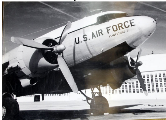
COANG C- 47 FLINTSTONE I

This is one of many stories of how the COANG has assisted the Colorado Community when other means of help were not available.